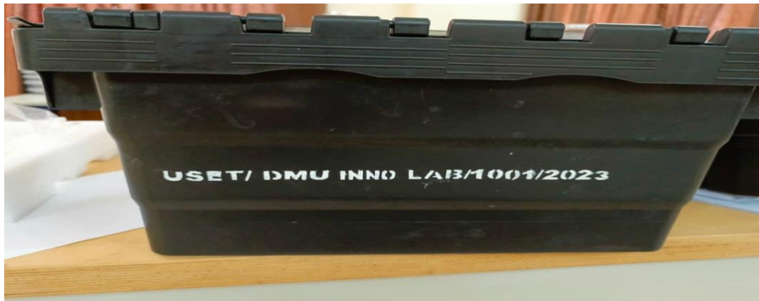
FIG 31: LOT4 ITEM 35 EV CHARGING POINT 7.4KW AND TABLE