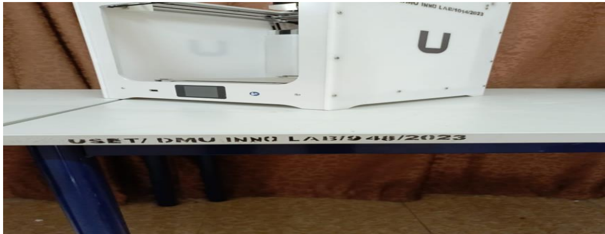
FIG 2: LOT4 ITEM 36 PC E HUB & COMBINE DESK-TABLE