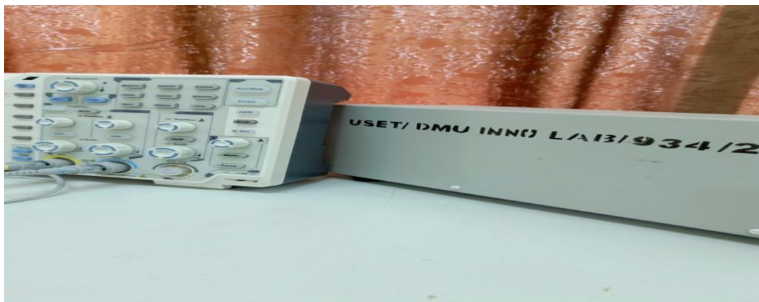
ITEM 13 OSCILLOSCOPE